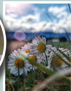
Honourable Mention: Blake Starostecki-Dyer

"SPECIES SURVIVAL - MORE THAN JUST SUSTAINABILITY."