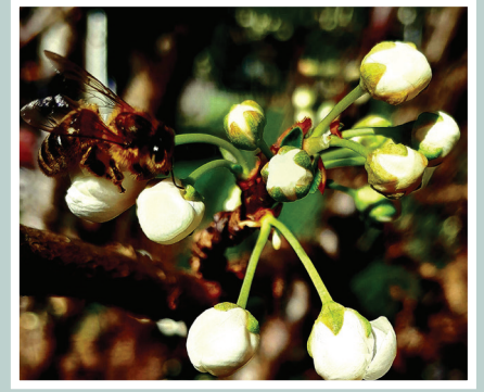
1 st place A'isha Strbac