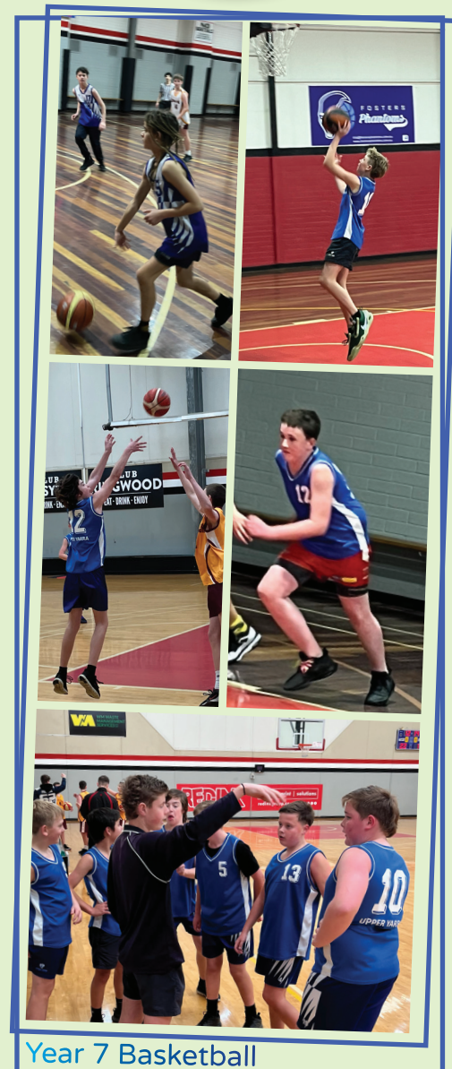
Year 7 Basketball