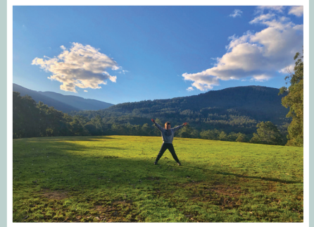
2 nd place Chad King